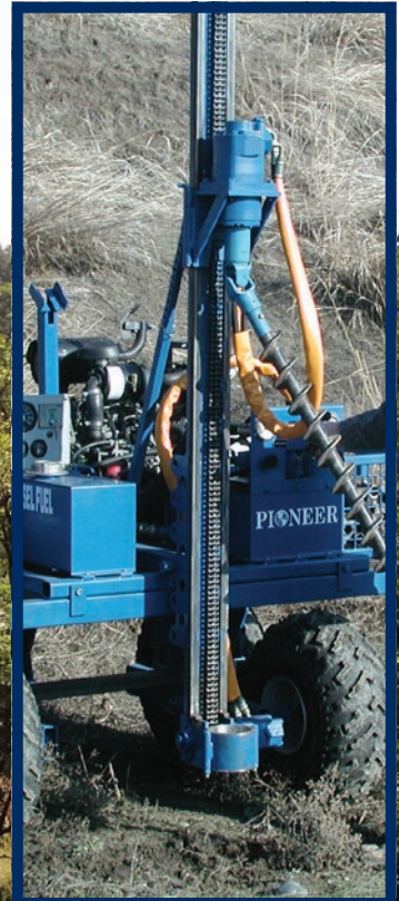
Specialty & Multi-Purpose